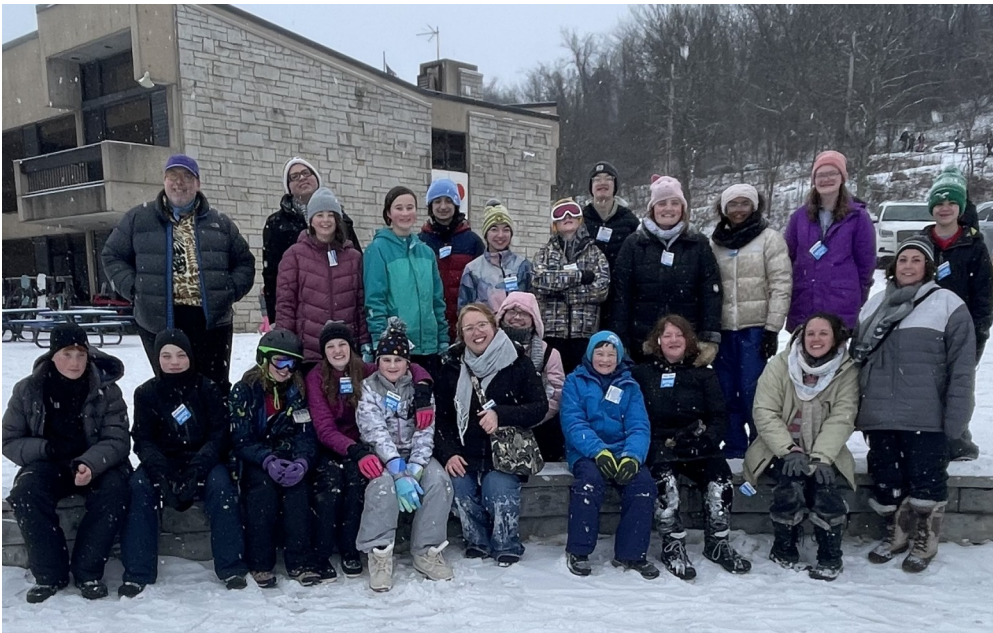
Pictured: Youth from Sixth and East Liberty Presbyterian Church spent a cold and snowy afternoon together snow tubing at Boyce Park.

April 4th - 6th - Spring Presbytery Youth Retreat @ Camp Crestfield